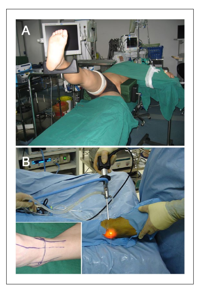
Figure 2. Anterior ankle arthroscopy. (A) A simulation photo showed the position switch from posterior to anterior ankle arthroscopy. Patient was first tilted posteriorly to change into the semi-supine position. With the hip externally rotated, the ankle joint finally switched to the usual orientation of the supine position. (B) Anterior ankle arthroscopy using standard the anterolateral portal and the anteromedial portal (inserted photo).

posteromedial portal to confirm the location. After removing synovial tissue, the flexor hallucis longus tendon was visualized, which was the crucial anatomical landmark in the posterior ankle arthroscopy (Figure 1D). Debridement should be done lateral to this tendon to prevent damaging the nerves and blood vessels. After adequate synovectomy, the os trigonum was located. After releasing the soft tissue around the os trigonum, the os trigonum or other bony prominences were resected. At the end of the posterior ankle arthroscopy, we could assess for posterior impingement by passive ankle plantarflexion.