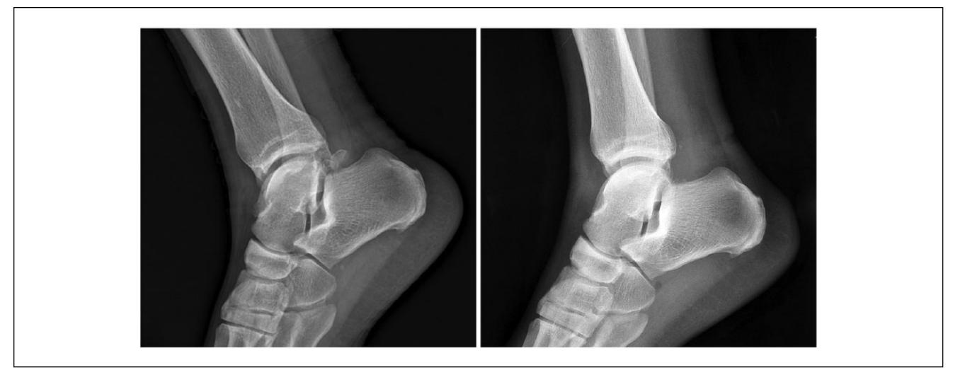
Figure 3. Preoperative and postoperative radiographs. (Left) Preoperative radiograph showed osteophytes on both the anterior edge of the distal tibia and os trigonum located posteriorly. (Right) Postoperative radiograph showed the anterior osteophytes and os trigonum were successfully removed.

For the posterior ankle lesions, Guhl et al<sup>6</sup> used external fixation with an articular retractor, inserting the small diameter (2.7 mm) scope from front to back into the posterior joint cavity. By establishing the posterior portal, they could inspect of the posterior ankle. However, the disadvantage of this technique was that since the external retractor fixed the joint in position, it was hard to evaluate the posterior ankle joint dynamically during surgery. In addition, only a small amount of joint inflow was possible, which often caused poor visualization. For better visualization during posterior ankle arthroscopy, the well accepted technique is in the prone position with 2 standard posterior portals.<sup>13,14,17</sup>